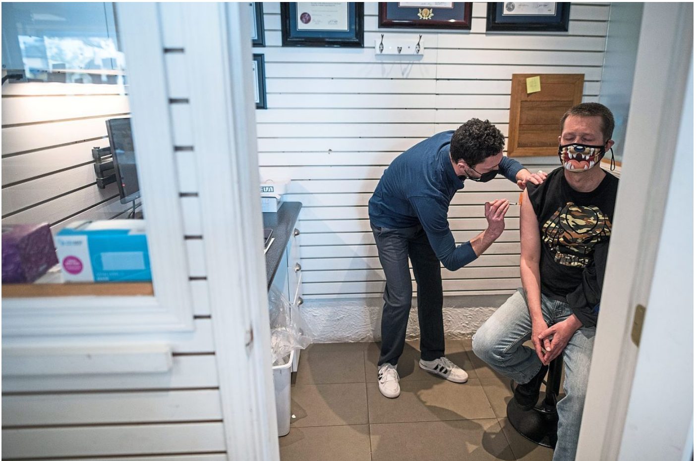
Community service: A pharmacist administering a Covid-19 vaccine at a pharmacy in Canada in April.

AS we all know, the best way to arrest the spread of Covid-19 is by achieving herd immunity, which means vaccinating 80% of Malaysia's population.